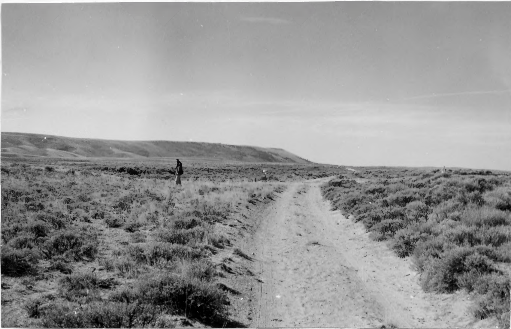
South Pass, located on the Continental Divide in Wyoming. To the emigrants of the 1840's and 1850's, it signified their entrance into the Oregon country.

National Park Service Photograph, October, 1958